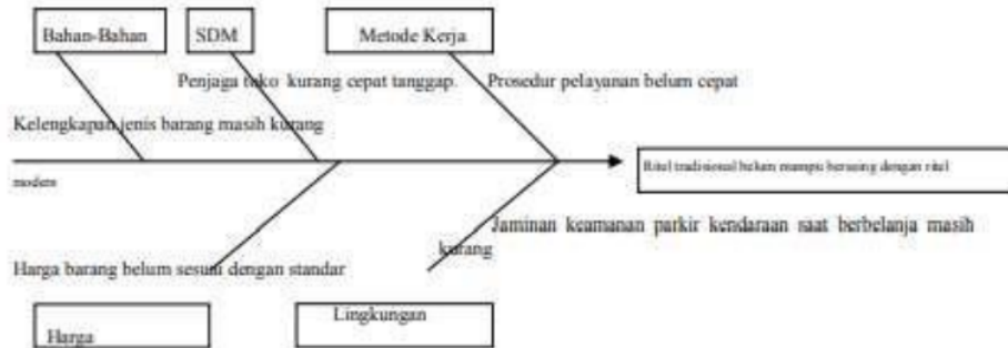
Figure 3. Fish Bond Diagram